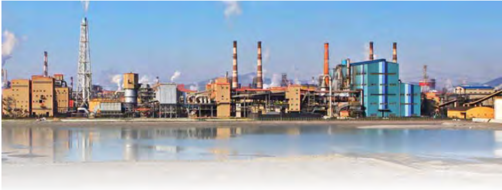
L'usine de Gwangyang en Corée du sud